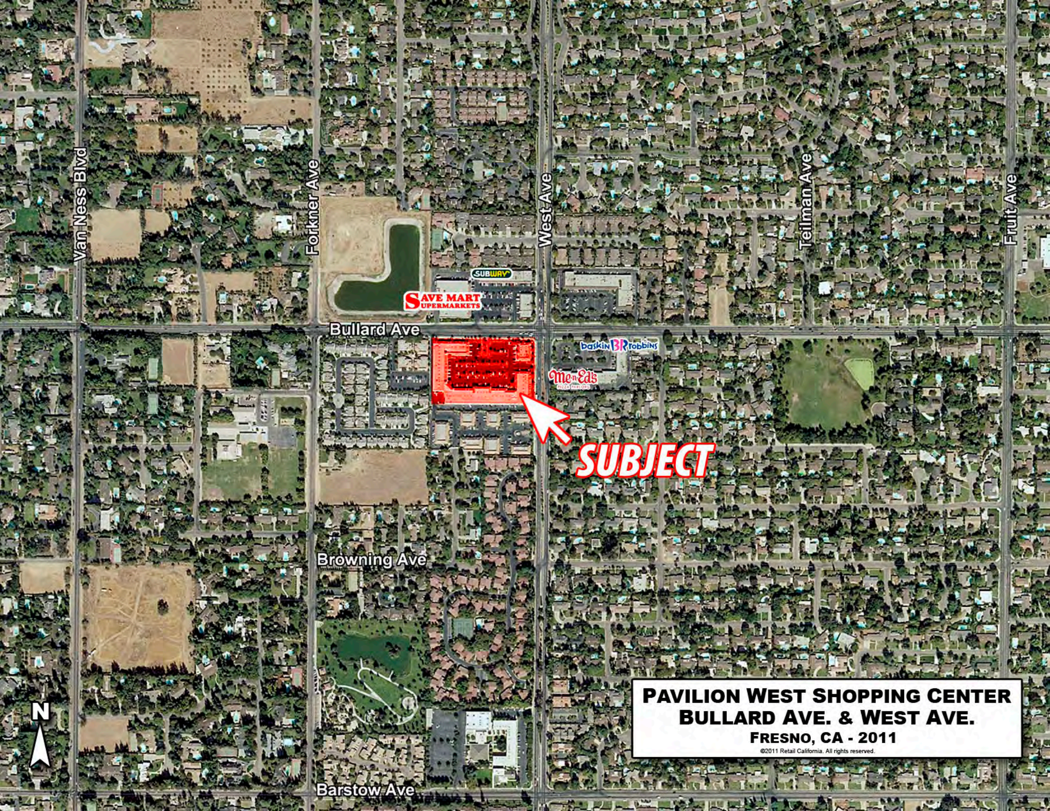
PAVILION WEST SHOPPING CENTER BULLARD AVE. & WEST AVE. FRESNO, CA - 2011